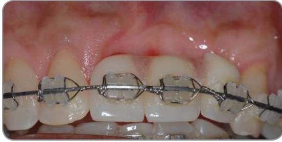
Preoperative view showing the horizontal ridge deficiency. Patient presented with a thin anterior ridge secondary to loss of teeth and bone following trauma.