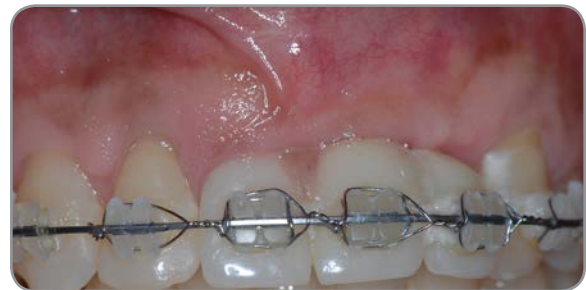
Four months post-graft appearance indicating sufficient ridge form for the proposed aesthetic restoration.