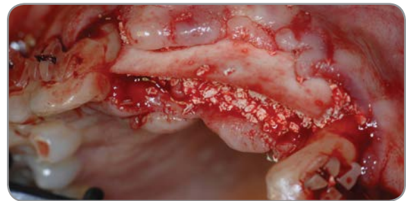
The full thickness flap is raised to the nasal floor without vertical releasing incisions. The defect is grafted with Endobon Xenograft Granules combined with fibrin glue and covered with an OsseoGuard® Membrane.