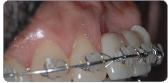
Lateral view showing the large anterior deformity. The treatment plan included at least a 6.0 mm ridge augmentation to achieve sufficient osseous structure for implant placement as well as restoration of the ridge contour.