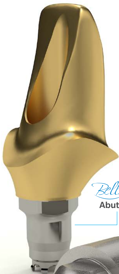
BellaTek ® Abutment