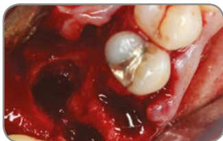
Figure A Clinical image showing the extensive bone loss on the palatal area extending past apex.