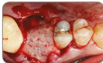
Figure B CopiOs Extend Membrane was laid over the graft and tacked under the flap.