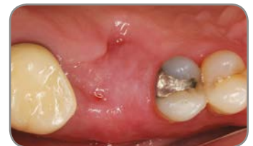
Figure D Two months postoperative. Excellent healing.

Clinical photos ©2013 Dr. El Chaar† All rights reserved. Individual results may vary.