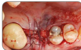
Figure C Flap sutured over the membrane.